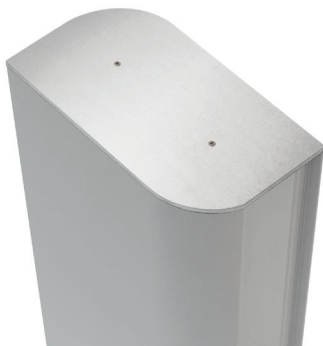
Brushed Aluminium Ends ▲

There is a very ample variety of formats to choose from.